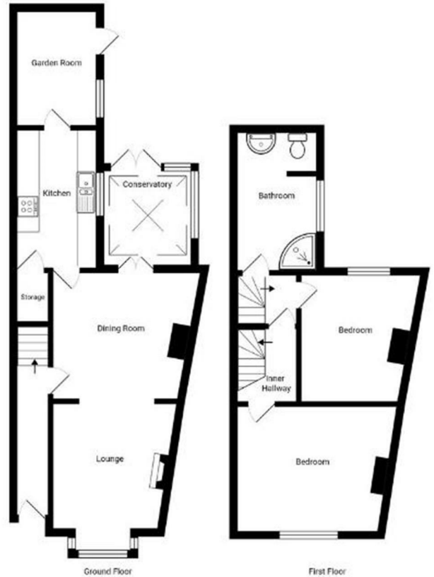
Total Area: 103.8 m² ... 1118 ft²

In accordance with current Anti-Money Laundering and Proceeds of Crime Legislation, all buyers are required to complete identity and verification checks. These checks are carried out on our behalf of Moverly, our approved AML provider. A £50 fee (incl. vat) covers required data and any manual checks. This must be paid before we can issue a memorandum of sale. The fee is non-refundable and paid directly to Moverly. We receive a portion of this fee for facilitating the checks